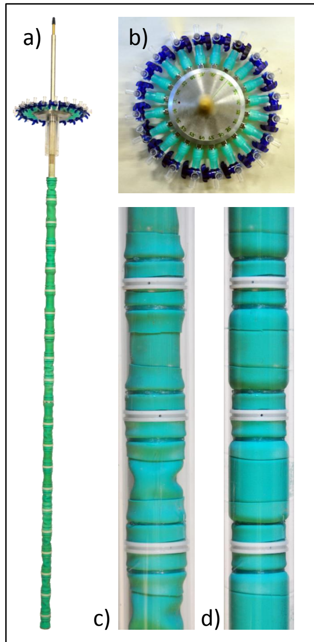
Fig. S4: Pictures of the MLS. a). Full-length picture. b) Top-down picture showing the 20 sampling valves. c) Close-up picture with c) deflated and d) inflated packer membranes in a transparent tube. Nauer et al., 2013.