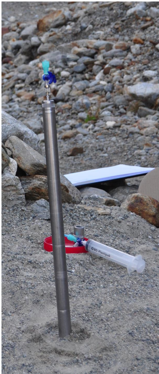
Fig. S3: Picture of the SR in use in a siliceous glacier forefield.