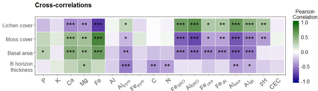
Figure S2: Cross-correlations heatmap between environment characteristics and chemical elements in B horizons. Correlations were computed on fully standardized variables using Pearson's coefficient method and tested by associated t-tests. Asterisks indicate statistical significance with *: p-value<0.05, **: p-value<0.01, ***: p-value<0.001.