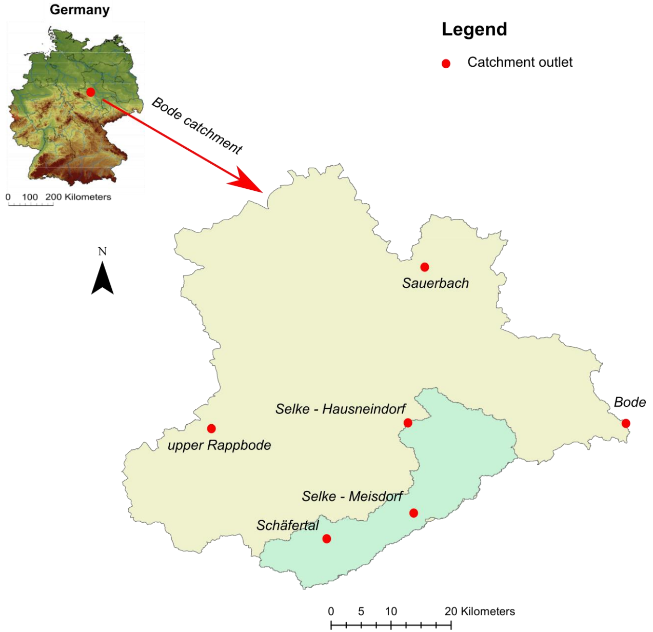
Figure S1: Localization of the TERENO Harz/Central German Lowland Observatory (Bode catchment) and of the study sites included in the present study.