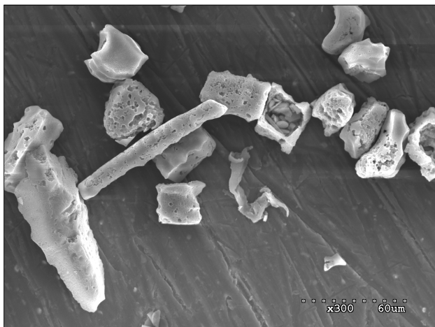
Fig. 3. Phytolith concentrate extracted at CEREGE from the Mascareignite level (10–20 cm) of volcanoclastic soils from La Reunion, France (Crespin et al., 2008). The SEM image is used here to show typical rough phytolith surfaces.