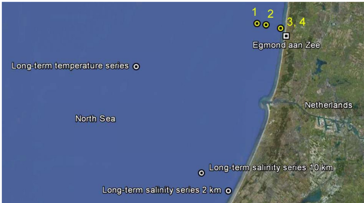
Fig. S1. Location of the sampling sites of E. directus (shells 1, 2, 3 and 4) and of the sites where water temperature and salinity were measured.