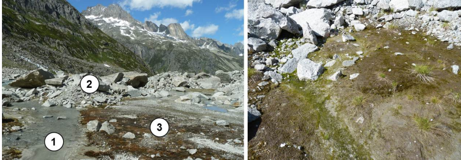
Fig. 2. Figure 3