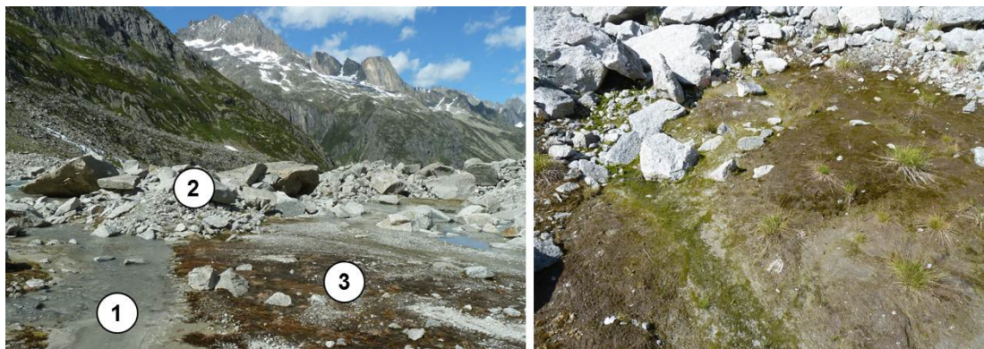
Fig. 2. Figure 3