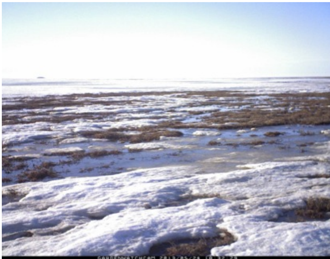
Fig. 2. Tundra in early spring on May 24, 2013 using the time-lapse camera