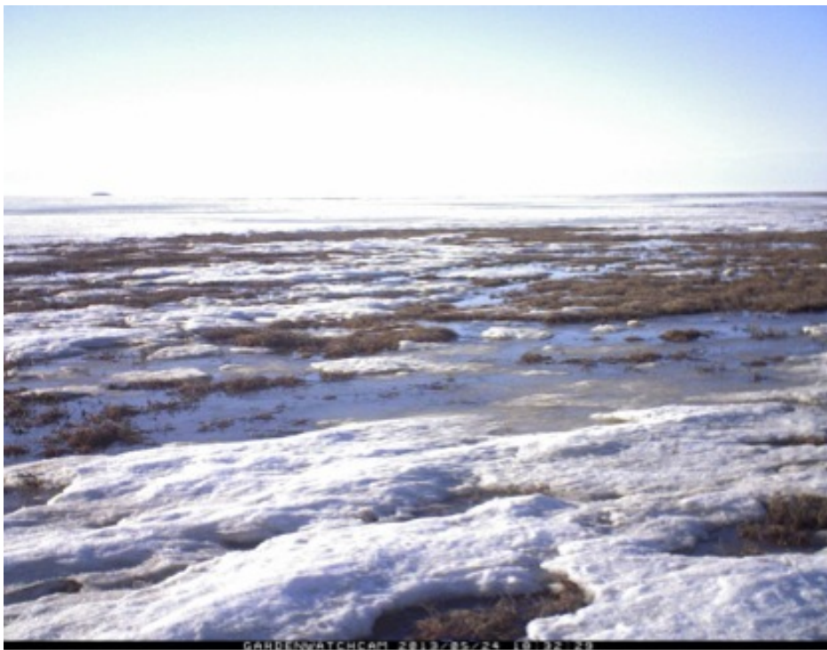
Fig. 2. Figure Tundra in early spring