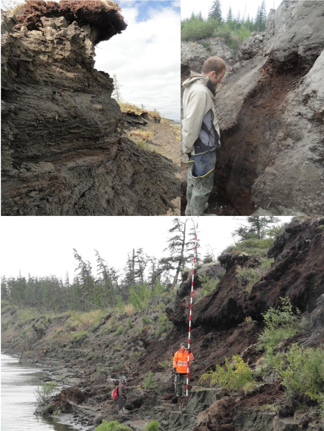
Figure 1. Photographs of peat-rich aluvial sediments studied by Walter Anthony et al. 2014. Lacustrine peat, consisting of benthic peat ( 82 \pm 3\% organic matter, n = 34 ) and buried peat facies ( 50 \pm 4\% organic matter, n = 67 ), often extend >6\text{m} below the ground surface.