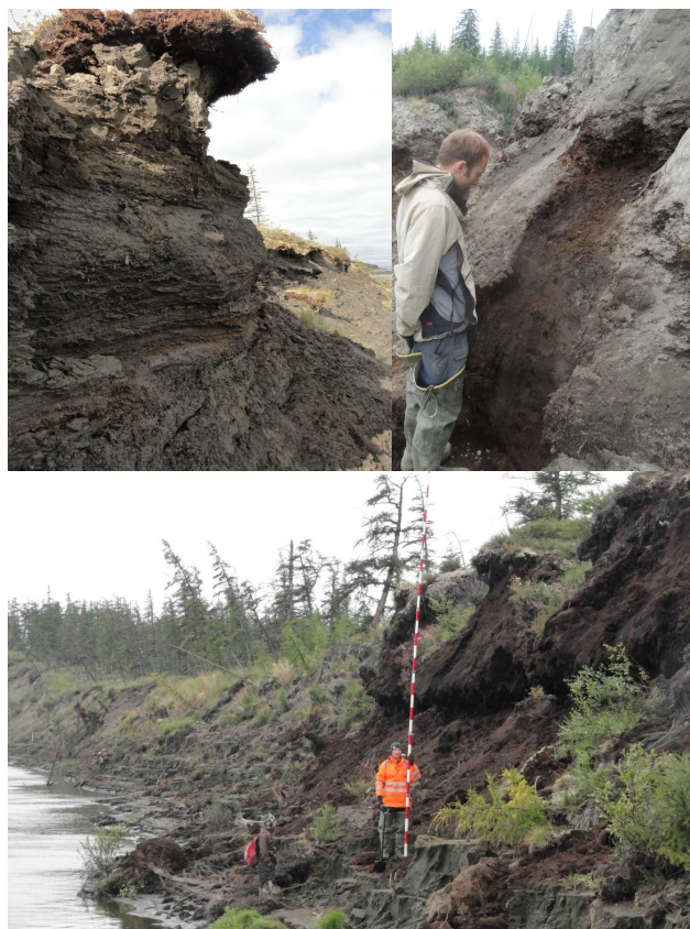
Figure 1. Photographs of peat-rich alaskan sediments studied by Walter Anthony et al. (2014). Lacustrine peat, consisting of benthic peat ( 82 \pm 3\% organic matter, n = 34 ) and buried peat facies ( 50 \pm 4\% organic matter, n = 67 ), often extend >6\text{m} below the ground surface.