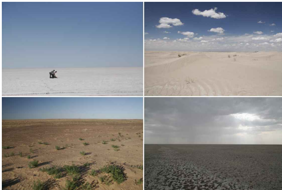
Fig. 3. Add Photographs