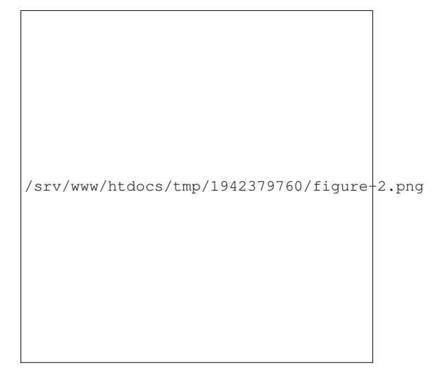
Fig. 2. Comparison between linear and power law for Fig 13...