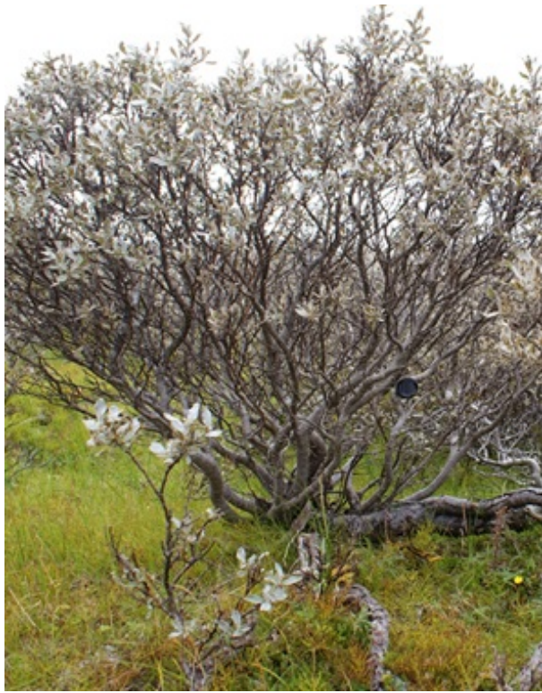
Fig. 2. Salix vegetation with lens cap (diameter 5.6 cm) as scale.