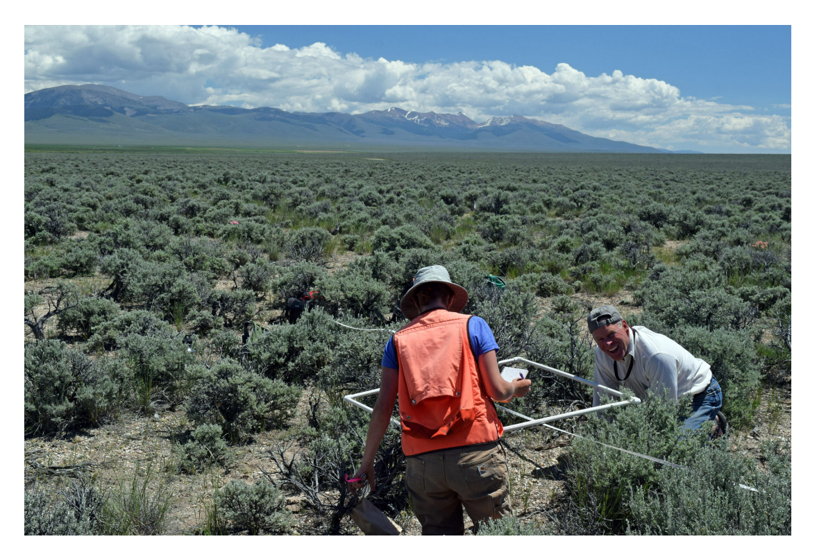
Fig. 1. Texas Fire sampling