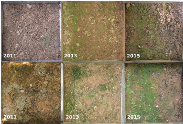
Figure 2: Successional stages of biological soil crusts in two exemplary runoff plots (top row and bottom row, 0.4 m × 0.4 m each) in 2011, 2013 and 2015 (from left to right) at the BEF China experiment in Xingangshan, Jiangxi Province, PR China.