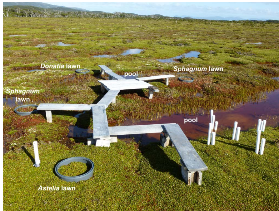
Figure S01. Arrangement of collars at platform 3 in the study site. Boardwalks were not installed between platforms to minimize disturbance of the cushion vegetation surface. Note the different types of microforms.

5 Correspondence to: Wiebke Münchberger (wiebke.muenchberger@uni-muenster.de), Klaus-Holger Knorr (kh.knorr@uni-muenster.de)