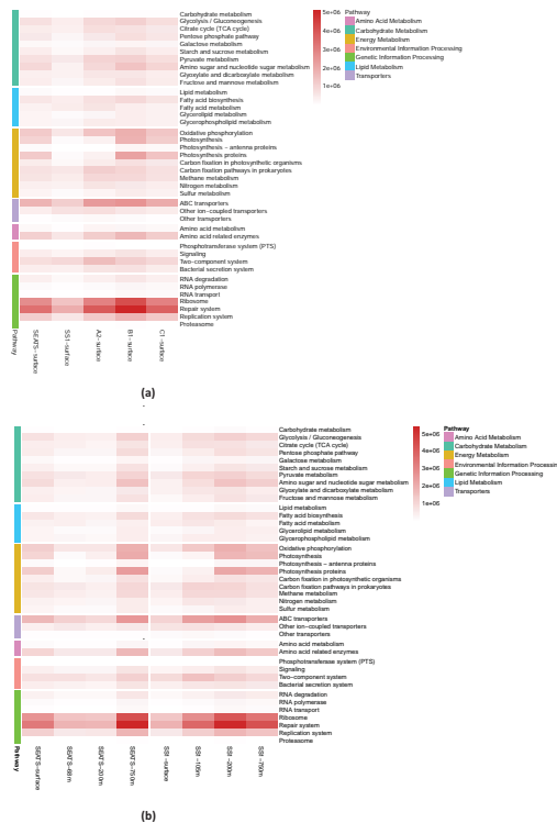
Fig. 3. Abundances and distributions of KEGG tier 3 KO categories predicted from PICRUST: (a) In surface samples; (b) Vertical profiles in SEATS and SS1.