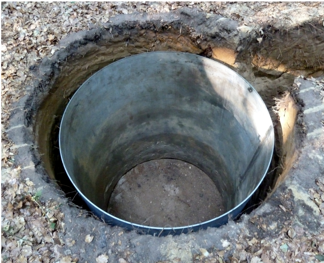
Fig. 2. Photograph of the used lysimeter vessel to drill the whole for the subsoil observatory.