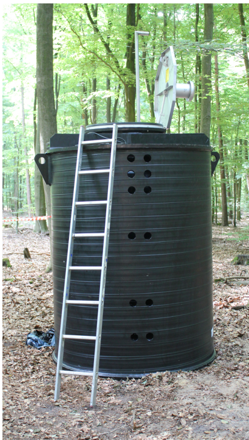
Fig. 3. Photograph of the used polyethylene shaft inserted thereafter.