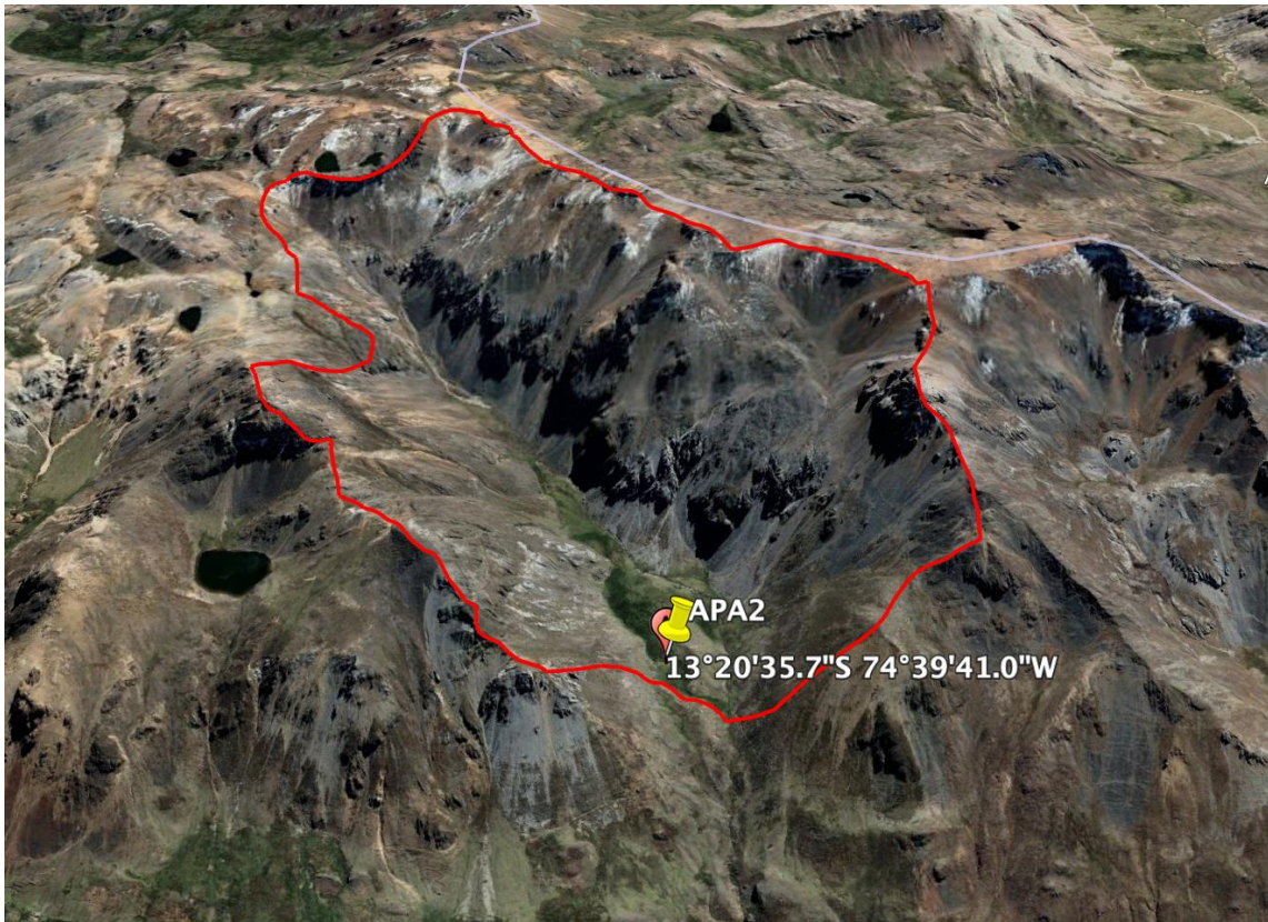
Figure RC1.2: The sub-catchment area of APA2.