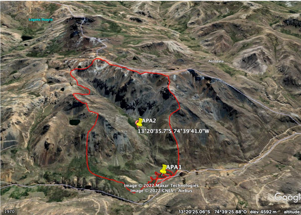
Figure RC1.1: The sub-catchment area of APA1.